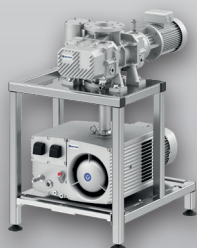
Booster pump stand

compared to vacuum pumps which are integrated into packaging machines